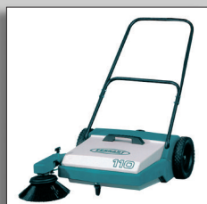
Side brush can be raised up