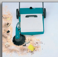
Side brush pushes dirt into the main sweeping brush path