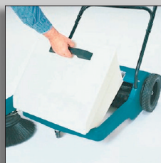
Easy hopper emptying