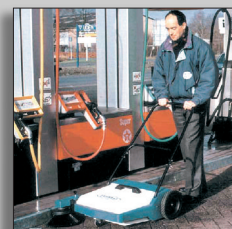
Machine in action