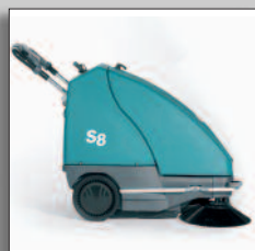
Strong roto-moulded covers