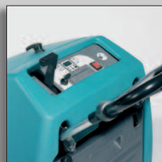
Easy to operate