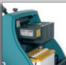
Standard on board charger