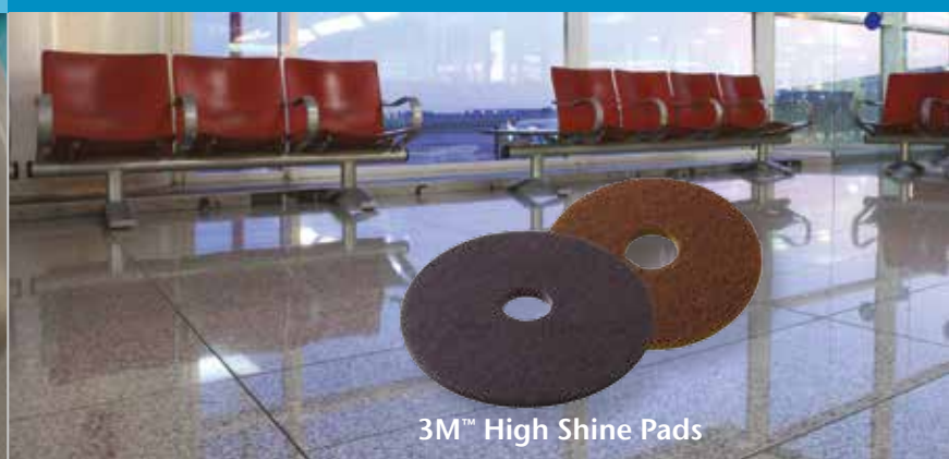
3M™ High Shine Pads