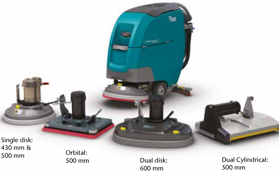
Single disk: 430 mm & 500 mm

The T300 scrubber-dryer provides multiple scrub-decks to fit your cleaning requirements and optimise cleaning performance.